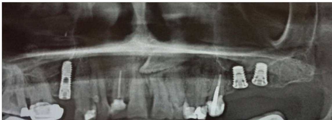
Figure 1: OPG of a case with bilateral perforation. implant length 5mm. bone height less than 5 mm.