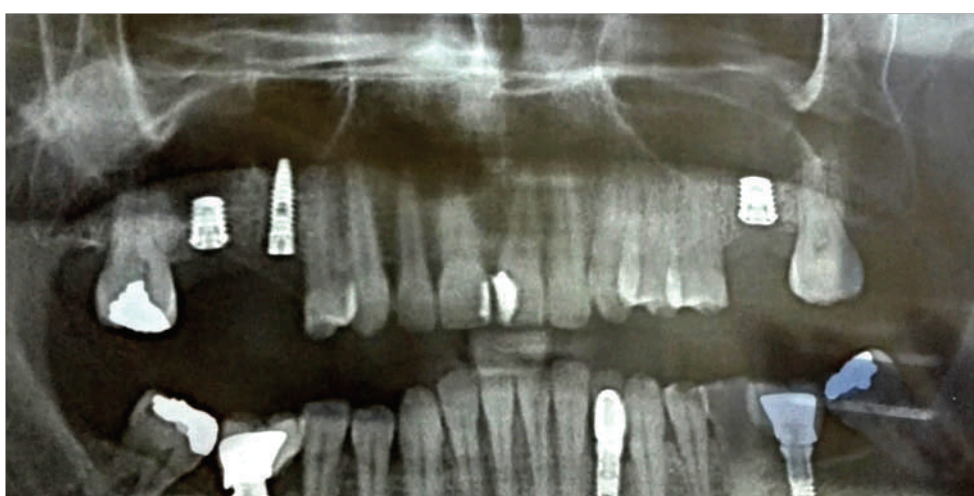
Figure 2: OPG of a case with double perforations on left site and single perforation on the right